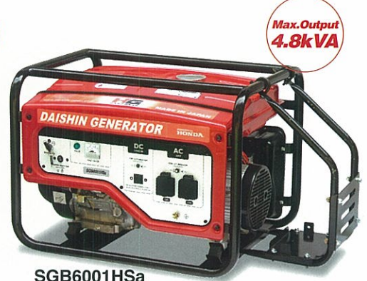
SGB6001HSa (Electric start model)