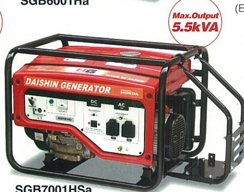
SGB7001HSa (Electric start model)